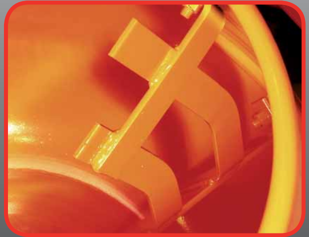
'Quick Mix' Bolt In Paddles