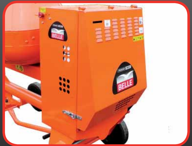
Lockable Engine Cover