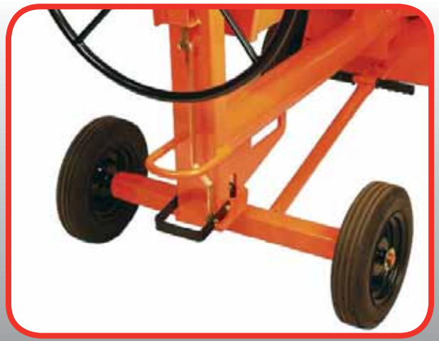
Foot Operated Tip Lock