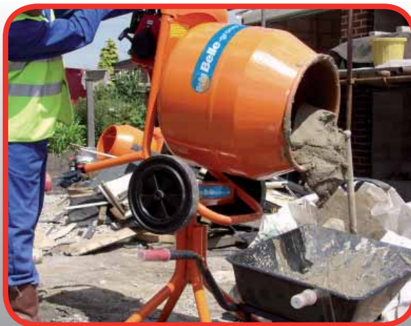
Barrow Height Tipping