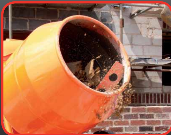
Rapid Mix Drum Paddles