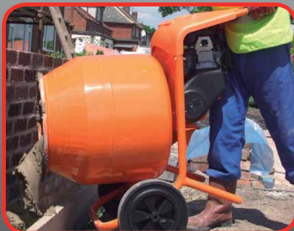
Balanced Design Ensures Control When Tipping